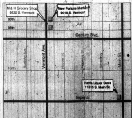
Armed robbers struck three Korean owned business in one-mile area within 21 hours.