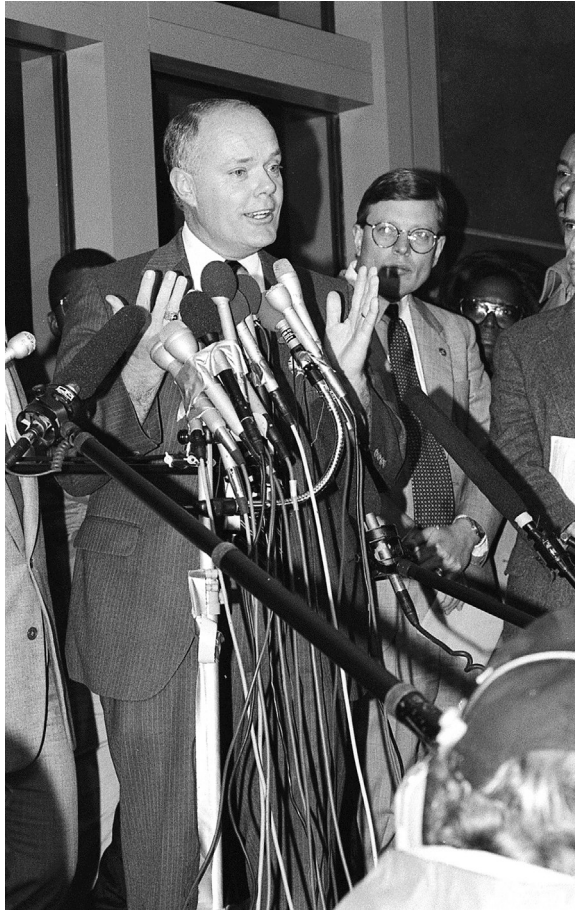
LAPD Sergeant Stacey Koon responds to media questions outside of the Edward R. Roybal Federal Building in downtown Los Angeles during the 1993 federal trial.