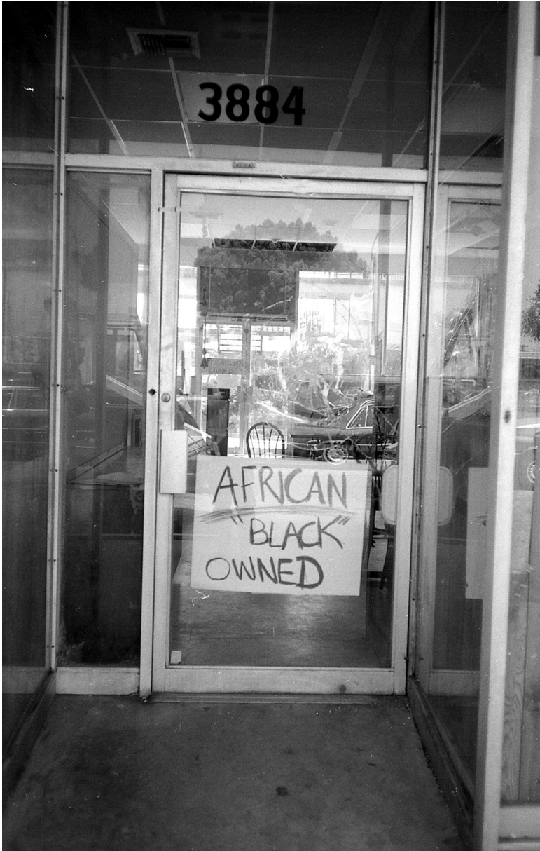
Variations of the phrase, "BLACK OWNED" appeared on businesses throughout L.A. Many non-blacks also wrote this on their stores hoping to save their businesses.