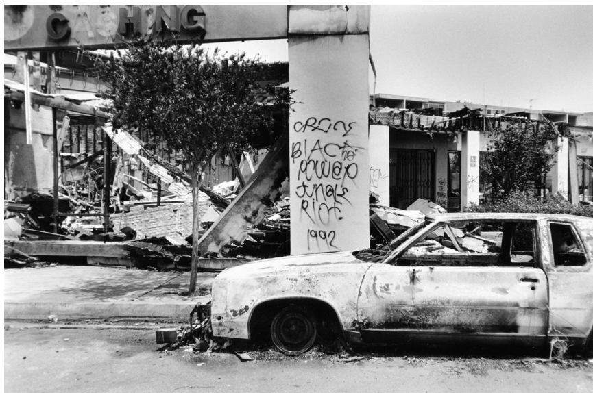
Aftermath: Burned out car and strip mall, across the street from a residential area that some people nicknamed "The Jungle." The wall reads, "Black Power Jungle Riot 1992"