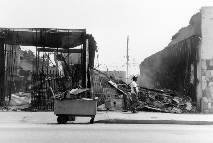
Aftermath: A burned out store in South L.A., 1992.